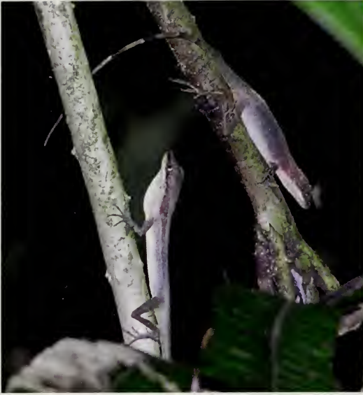
Figure 1. A male A. limifrons displays to a female on an adjacent perch. These animals were observed in close proximity and were interacting. No other lizards were observed in the area, suggesting that these animals form a pair.

sleeping males and females ( A. occultus : Gorman, 1980; A. cuvieri : Ríos-Lopez and Puente-Colon, 2007). This study had three objectives: to observe pairs of A. limifrons at the site where Talbot collected his data, to determine if such pairs demonstrate size-assortative pairing, and to compare the morphology of paired and unpaired animals.